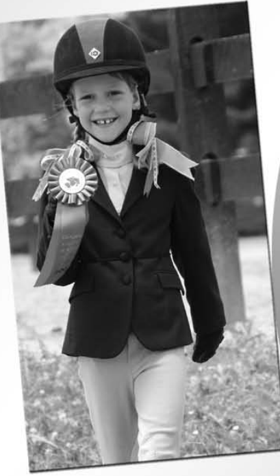
NEW Dressage Department!