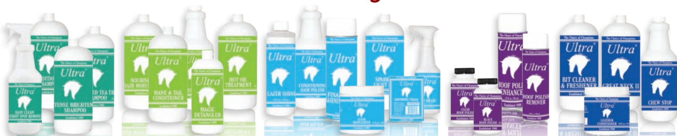
Coat Enhancing Shampoos